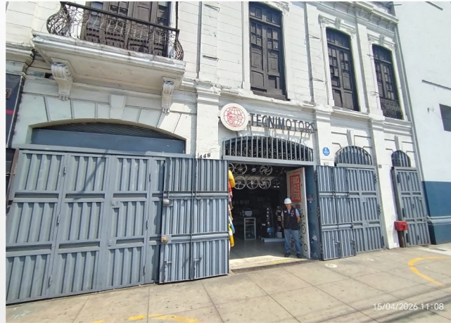
Iquitos/Canta Warehouse Area: +4,300m 2 Fast-response inventory center and commercial showroom