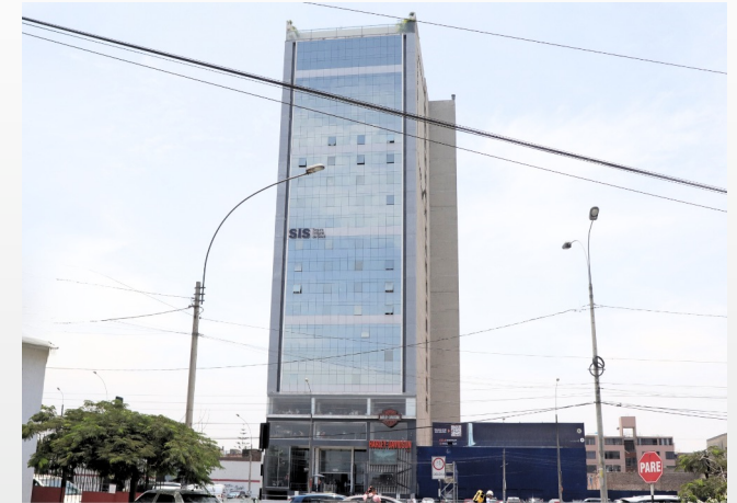
Los Brillantes Headquarters Area: +20,000m 2 Management, sales, and main commercial showroom