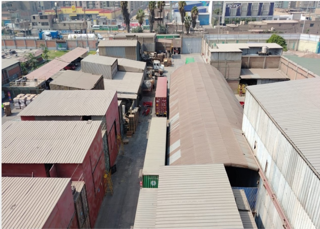
Ate Logistics Center Area: +14,000m 2 Primary wholesale distribution hub.